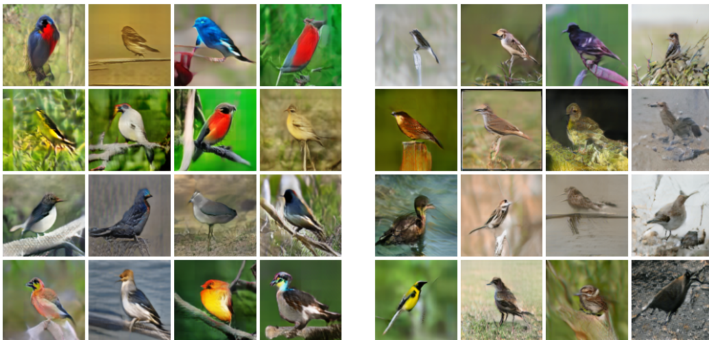
Figure 3: Sample Diversity on CUB200: We showcase samples from a BigGAN (pretrained on imagenet and finetuned with the DMAT procedure (left four columns) and from an identical BigGAN finetuned without DMAT (right four columns). We observe that while the sample quality is good for both setups, the samples generated with DMAT are more colorful & diverse, exhibiting bright reds and yellow against a variety of backgrounds. While the samples from vanilla fine-tuning are restricted to whites/grays & only a hint of color. In contrast, training the same generator with the proposed DMAT procedure leads to stable training with almost all the modes being covered and the classification accuracy increasing before saturation. Catastrophic forgetting is thus effectively sidestepped by dynamic multi adversarial training which produces stable discriminative features throughout training that provide a consistent training signal to the generator thereby covering all the modes with little degradation.