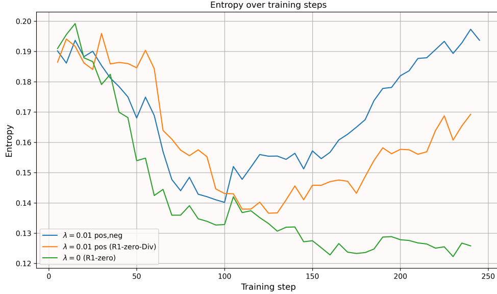
Figure 3: Entropy during the RL training