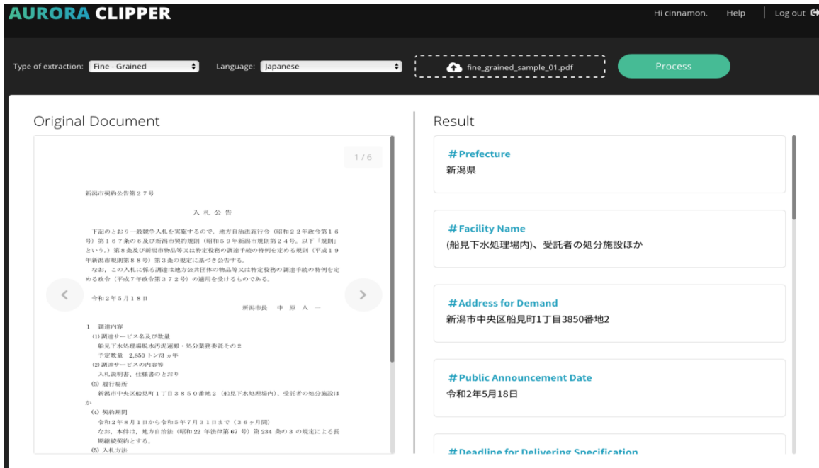
Figure 2: The web interface of Aurora.