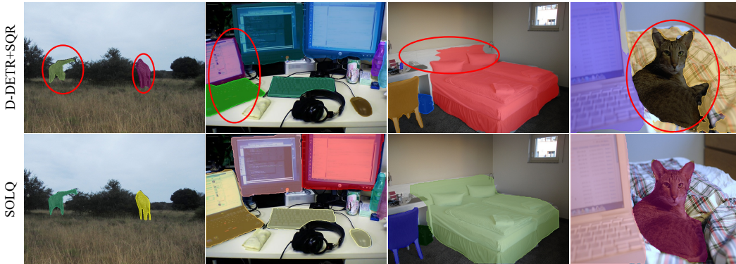
Figure 3: Visualization comparisons between Unified Query Representation (UQR) and Separate Query Representation (SQR) on the COCO 2017 val set. For more visualization comparison, please refer to Appendix A.4.

our ablation experiments are conducted using the single feature level with C5 and validated on the COCO 2017 val set.