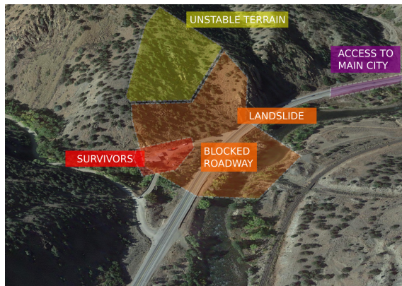
Figure 2. Visualization of the scenario investigated in this work. An earthquake-triggered landslide destroys a residential area and blocks the main access to the city. There might be survivors in the affected area and the roadway needs to be cleared so the emergency response teams can also reach the city that was also affected by the earthquake. The unstable terrain on top of the hill might also lead to new landslides.

information to generate plans of action for disaster response scenarios, as shown in Appendix A. DisasterResponseGPT then asks the user for the scenario description, main objectives, available assets and main problems to be addressed. Next, a message automatically aggregating this information is prepared and sent to DisasterResponseGPT, which in turn replies with three developed plans of action describing the main objective and what is critical to complete it, main and auxiliary operations of the plan (including tasks, purpose, and which assets are performing each task), the end states for the operation, and how each plan of action is feasible, acceptable, and suitable for the scenario. The user interacts with DisasterResponseGPT via language to select a refine a plan of action until the user is satisfied with the final output. We compared the plan of action generated by a human against the ones generated by DisasterResponseGPT with three different LLM as backend: GPT-3.5 and GPT-4 by OpenAI, and Bard by Google. The full conversation transcripts for each baseline are available in Appendix B.