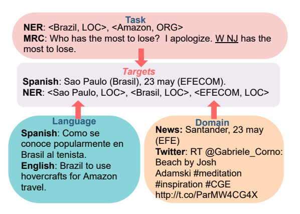
Figure 1: The example of the Targets and essential knowledge from three aspects, i.e., Task, Language, and Domain. The middle rectangle denotes an Spanish NER example in news domain, which is referred as the Targets . The rounded rectangle above the Targets denotes knowledge from different tasks. The bottom left one denotes essential knowledge in Spanish and English languages. The bottom right one denotes knowledge in News and Twitter domains.

* Work was done when Ying Zhang was interning at Pattern Recognition Center, WeChat AI, Tencent Inc, China.