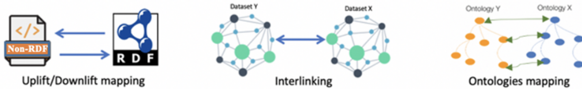
Figure 1: The three categories of mappings.

This study addresses all three. Uplift mappings used to convert data into RDF, e.g. [10]. Interlinking identifies relationships between entities across datasets [11], while ontology alignment establishes correspondences between concepts in different ontologies to enable semantic interoperability [12].