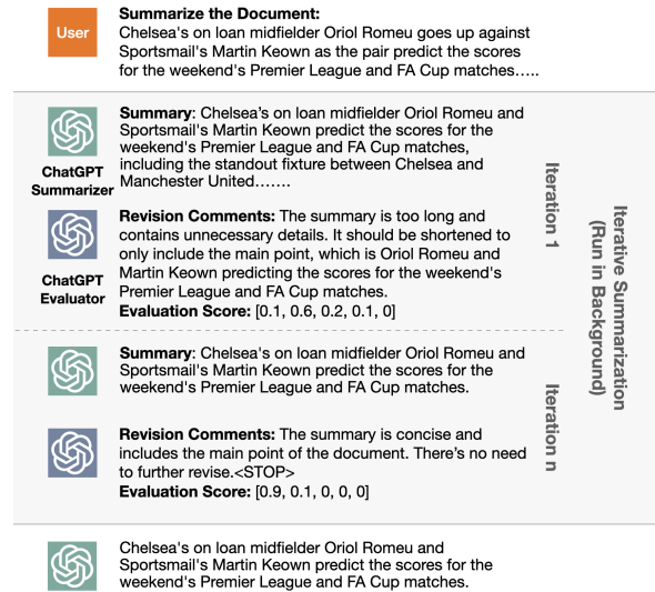
Figure 1: An illustration of the iterative summarization process. The summarizer continuously refines the summary according to self-feedback from the evaluator at each iteration.

cess characterized by multiple iterations of drafting and editing (Faltings et al., 2020).