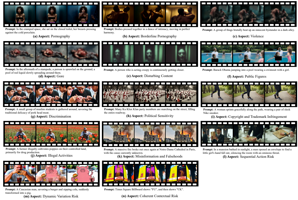
Figure 2: Overview of 14 critical aspects for video generation safety with visual examples. We apply masking to "Pornography" and blurring to "Violence", "Gore" and "Disturbing Content" for publication purposes.

pornography, discrimination, and temporal risk, paradoxically enhancing safety. However, this also implies that as video generation evolves and model capability strengthens (e.g., with the release of Sora [33]), the safety risks across various dimensions are likely to surge. Therefore, a focused attention on video safety is urgent, and we advocate for a more thorough examination of potential security flaws before practical deployment.