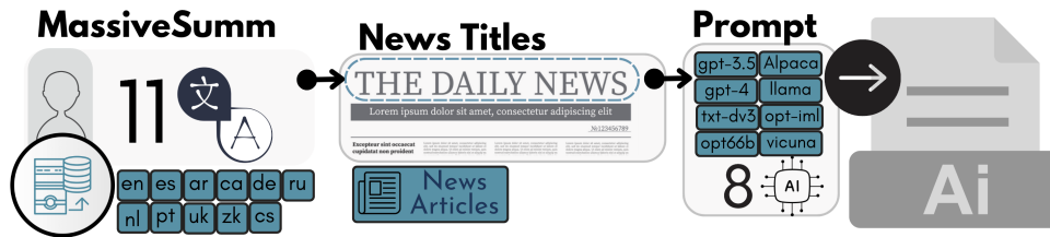
Figure 2: MULTITuDE generation framework.

2019) and GROVER 3 (Zellers et al., 2019) generated texts. However, as more Language Models (LM) got deployed, the need for more datasets from different LMs arose. Therefore Uchendu et al. (2020) released the first multi-generator (8 LMs) dataset in the news domain and Uchendu et al. (2021) released the first benchmark dataset (19 LMs) and environment for machine-generated text detection . Next, researchers released datasets for different domains - Academic papers (Liyanage et al., 2022; Rosati, 2022), News, Reddit posts & Recipes (Cutler et al., 2021), Amazon reviews (Adelani et al., 2020), multi-modal (i.e., images & texts) news articles (Tan et al., 2020), Tweets (Fagni et al., 2021), COVID-19 articles (Pagnoni et al., 2022), deepfake text in-the-wild (Pu et al., 2022a), gamification of MGT detection (Dugan et al., 2022), essays (Liu et al., 2023), prompt-generation (Anand et al., 2023; Peng et al., 2023), and multi-generator (27 LLMs) multi-domain (i.e., news, story, question, argument, scientific, etc.) data (Li et al., 2023).