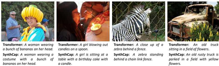
Fig. 2. Qualitative comparison between SynthCap and the baseline on sample images from the COCO dataset.

seeds. Also in this setting, SynthCap achieves the best results according to all evaluation metrics. Finally, in Fig. 2, we show some qualitative results on sample images from the COCO dataset, comparing captions generated by our model with those generated by the baseline without synthetic data augmentation.