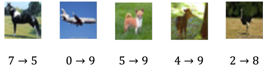
Figure 2: The targeted images for random seeds 0 ~ 4. The number before \rightarrow is original label, and the number after \rightarrow is the targeted label (adversary-defined label).

We set the poisoning rate as 1%, which means the proportion of poisoned data in the training dataset is only 1%. With this attack setting, even if a dataset inspector randomly inspect 50 samples, the probability that the inspector can not find a poisoned data sample is approximately (1 - 0.01)^{50} \approx 0.605 . In another word, even if we set a large perturbation size for those poisoned data samples, it is still very likely that the inspector could not detect the attack without investing much human labor into the inspection. Therefore, in our experiments, we set the perturbation size as 64/255 by default, and we also conduct experiments with other perturbation sizes. Note that in most experiments, this perturbation size is not enough to change any poisoned data sample into the targeted sample since in most cases, even smallest \ell_\infty distance between the targeted sample and a poisoned data sample is larger than 64/255.