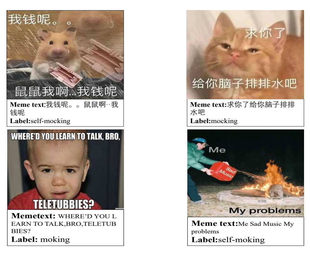
Figure 1: Presentation of some Chinese and English meme data