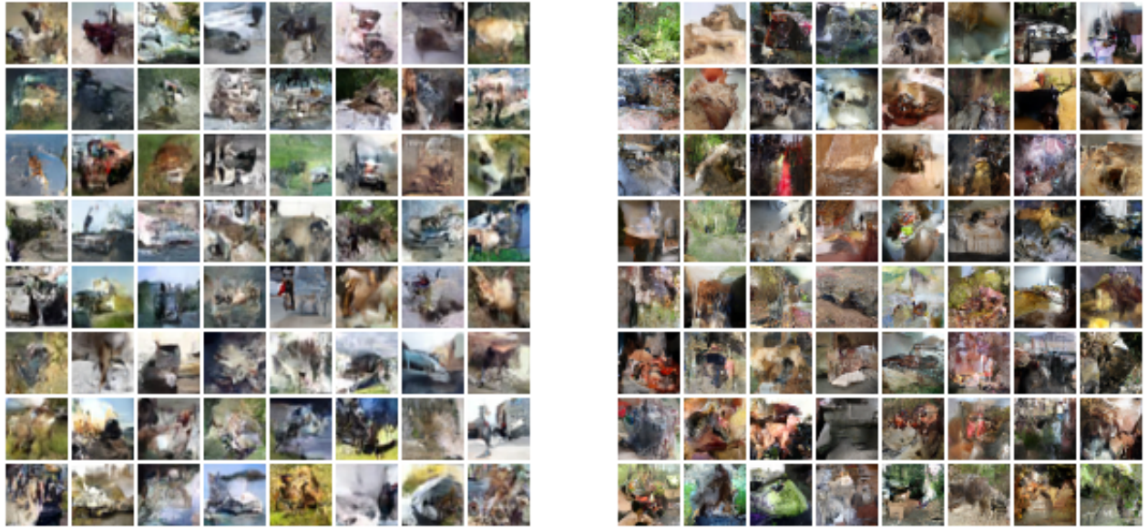
Figure 2: Left: Samples generated by using a pretrained model on CIFAR10 dataset. Right: Samples generated by using a pretrained model on ImageNet32 dataset.

as a simple function, for example, a quadratic function in v . In FFJORD, the integrand needs to be a neural network with D input variables x_1, \dots, x_D . To evaluate the integral of such a complicated integrand accurately, a large number of quadrature nodes are needed, which will increase the cost in both forward and backward transformations. Additionally, AUTM enables the use of user-defined integrand g , which will be beneficial if prior information of the transformation to be learned is available.