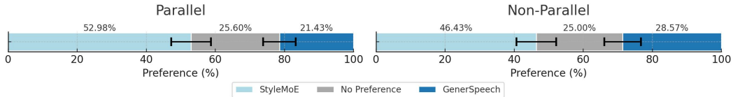
Figure 2: Style preference test on ESD reported with 95% confidence intervals.

lower distortion. StyleMoE-TTS achieves consistently lower MCD scores compared to the baselines. Finally, we report F0 frame error (FFE) (28), where StyleMoE-TTS achieves lower FFE, indicating better capture of low-level prosodic characteristics. We include a gating analysis in the appendix sec. 7.1 to visualize the utilization of style experts across hierarchical levels and emotions.