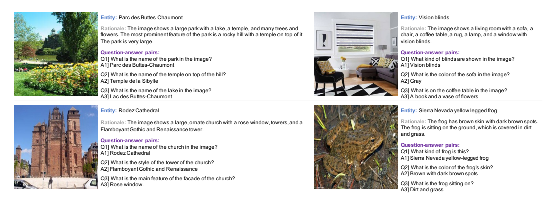
Figure 4: Qualitative examples of entities, rationales and question-answer pairs obtained with the multi-modal LLM. Our prompt encourage asking questions about diverse entities in the image.