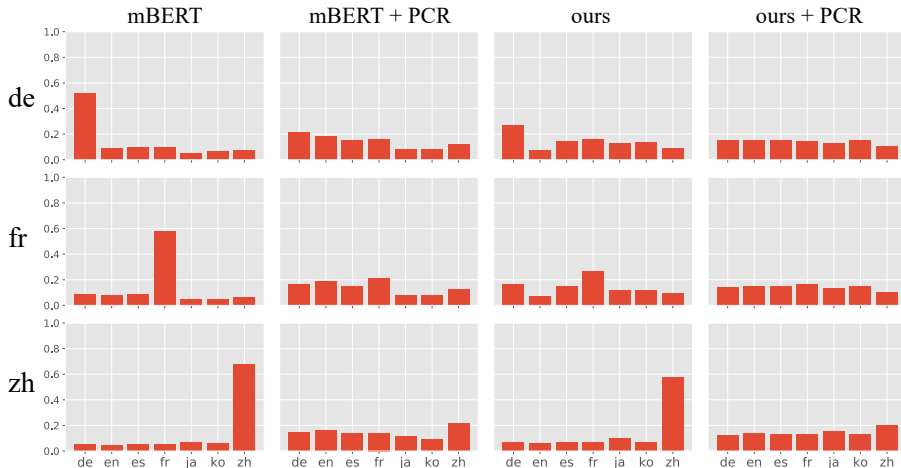
Figure 2: Language distribution of retrieved sentences. The first and third columns are mBERT and our models. Our model already in general has a more uniform distribution than mBERT. The second and fourth columns are mBERT and our model with PCR.

consists of English sentences and their translations in other six languages ( x -axis labels in Fig. 2). Given a query, we inspect the language distribution of the retrieved sentences (by ranking cosine similarities). In Fig. 2, query sentences are in German, French and Chinese for each row. Representations of mBERT (first row) have a strong self language bias, i.e. sentences in the language matching the query are dominant. In contrast, the bias is much weaker in our model trained with CMLM and BR (the third column), probably due to the cross lingual retrieval pretraining. We discover that removing the first principal component of each monolingual space from sentence representations effectively eliminate the self language bias. As shown in the second and the fourth column in Fig. 2 with principal component removal (PCR), the language distribution is much more uniform. We further explore PCR by experimenting on the Tatoeba dataset. Table 5 shows the retrieval accuracy of multilingual model with and w/o PCR. PCR increases the overall retrieval performance for both two models. This suggests the first principal components in each monolingual space primarily encodes language identification information .