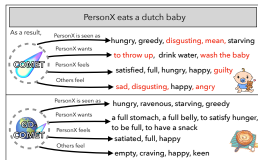
Figure 1: Inferences from COMET and GD-COMET for the sentence “PersonX eats a dutch baby”, demonstrating lack of culture awareness in COMET.

In this paper, we focus on a popular model for commonsense reasoning, COMET (Bosselut et al., 2019), which is based on an English language