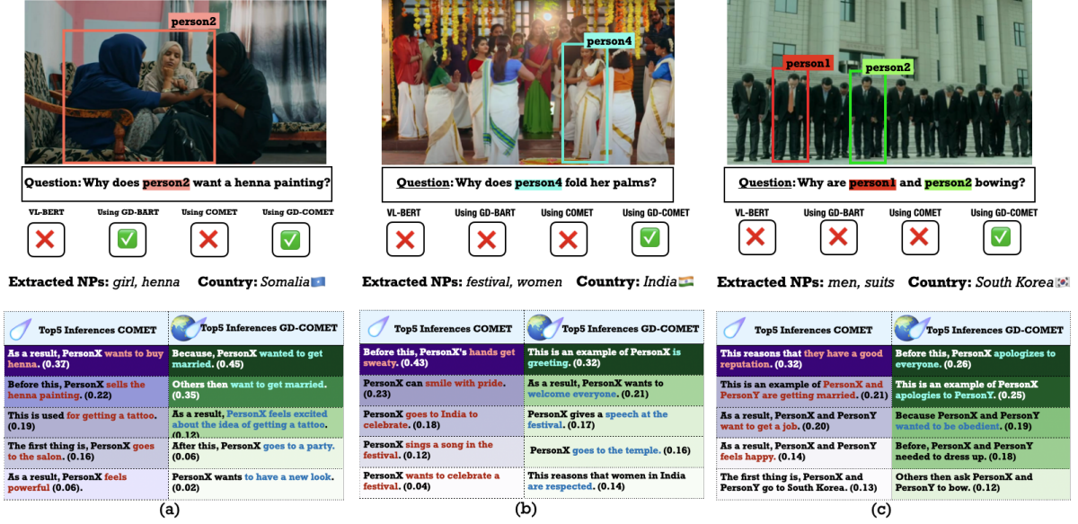
Figure 3: Attention analysis of commonsense inferences generated by COMET and GD-COMET for testing samples in GD-VCR.

firmly the effectiveness of GD-COMET in incorporating and leveraging cultural cues. We view our work as a step towards developing more inclusive and culturally-aware AI systems.