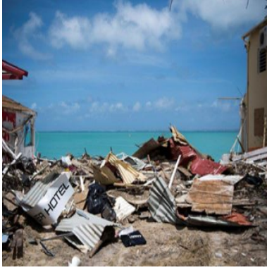
Figure 3: Tweet Text: The Hotel Heroes of Hurricane Irma https://t.co/Ge3QFiCVte https://t.co/8oA9wbPqeu

Actual tag: Task 1: informative ; Task 2: damage ; Task 3: Severity: severe - Structure: building Predicted: Task 1: Text and Image: informative ; Task 2: Text- non informative ; Image- damage ; Task 3: Severity: severe – Structure: building