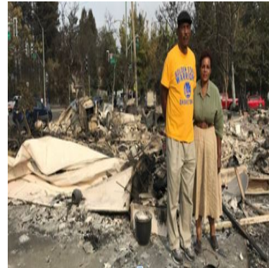
Figure 2: Tweet Text: California wildfire evacuees just want to "go home" if they have a home still standing https://t.co/wOxKyYDHxt https://t.co/h5RQDtVsHw

Qualitative analysis: We perform a qualitative analysis of a few images to show how the model predictions work. This also justifies the design choices which we have made in terms of the model selection.