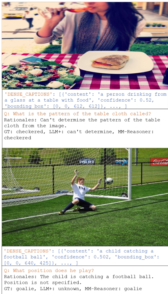
Figure 3: MM-Reasoner can effectively utilize visual features to find the correct answer by leveraging a VLM as its answer module. GT is ground truth and LLM + is a baseline model that prompts GPT-4 with textual descriptions obtained from vision APIs and the question to generate an answer. LLM + fails since the textual descriptions from APIs do not provide useful information.

MM-Reasoner is an integrative and composable framework that works with a variety of existing LLMs and VLMs. Since these LLMs and VLMs have already been trained on large-scale datasets, the fine-tuning cost of MM-Reasoner is much lower than that of existing models. We have conducted extensive empirical studies on MM-Reasoner using several datasets. The results show MM-Reasoner achieves state-of-the-art accuracy on the KVQA task, achieving 60.8% accuracy on the OK-VQA dataset, 60.2% on the A-OKVQA dataset, and 40.0% in the few-shot setting on the OK-VQA dataset. The project page is available at https://github.com/microsoft/i-Code/tree/main/mm-reasoner . In summary, the key contributions of this paper are as follows: