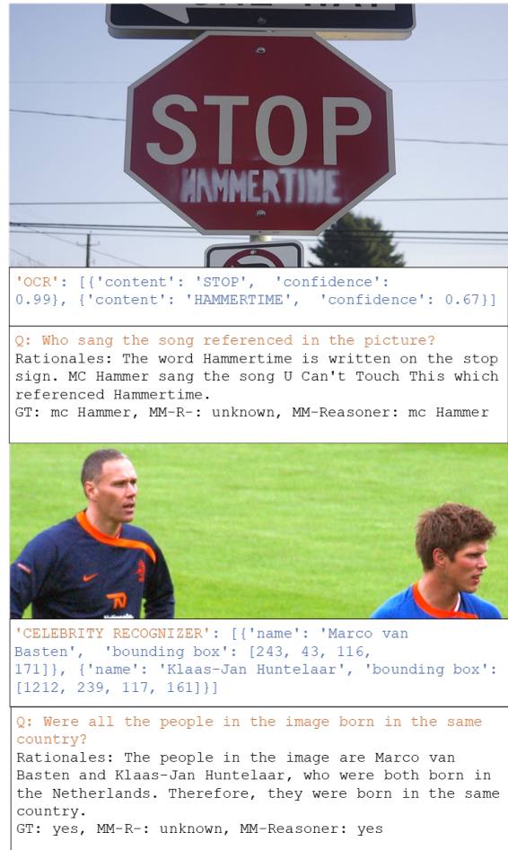
Figure 2: OCR and celebrity recognizer are helpful for answering questions. GT refers to the ground truth, and MM-R - is a baseline model similar to MM-Reasoner, but it uses a global caption instead of vision APIs.

Then, the MM-Reasoner leverages an LLM to