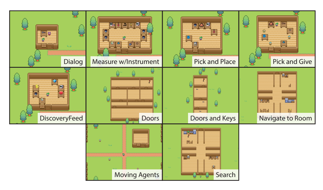
Figure 3: Example instances of the 10 Unit Test themes.