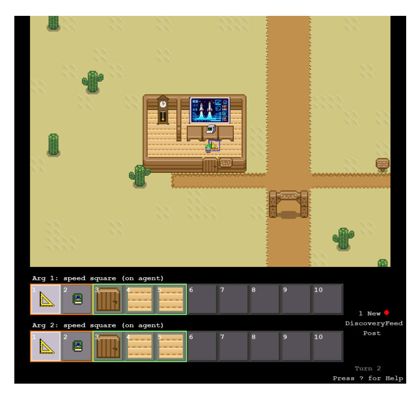
Figure 4: Example of the user interface the participants used. This is for the It's (not) Rocket Science! theme.

Zero-shot Performance While participants were allowed to retry tasks that they did not complete successfully the first time, we did not include any retries in our evaluation of human performance, to give an accurate analog of zero-shot model performance.