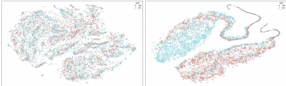
Figure 2: tSNE plots of the learned CLS embeddings on the SST-2 test set in the few-shot learning setting of having 20 labeled examples to fine-tune on – comparing RoBERTa-Large fine-tuned with CE only (left) and with our proposed objective CE+SCL (right) for the SST-2 sentiment analysis task. Blue: positive examples; red: negative examples.