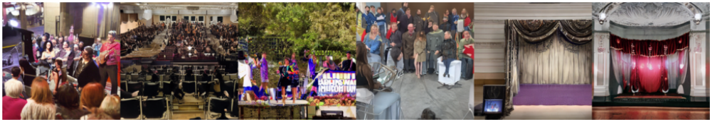
(a) Sample synthetic images of class "stage"