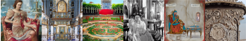
(b) Sample synthetic images of class "throne"