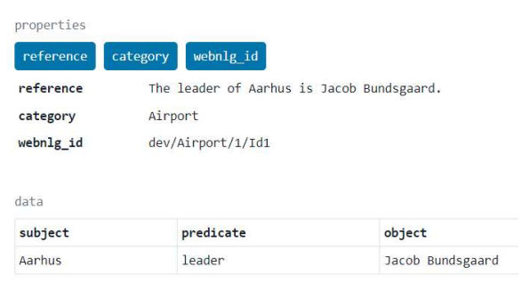
Figure 1. A random example of WebNLG.

a single sentence (reference). In Figure 2, from a set of triples (source), the model can generate a short paragraph (target). This project aims to create longer texts.