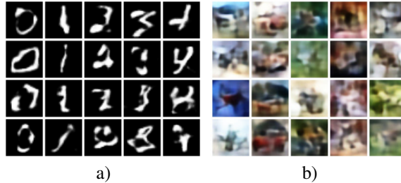
Figure 3: Generated OoC examples by our approach. a) MNIST examples for digit classes 0-4 (left to right). b) CIFAR10 examples for classes airplane , automobile , bird , cat and deer (left to right). See figure 5 for more examples.

value range, which can have a large impact on the p -norm distance metrics, and to the exponential scaling for very small angular distances.