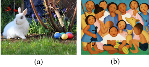
Figure 1: (a) Easter Bunny. (b) Tarsila do Amaral’s The Family.