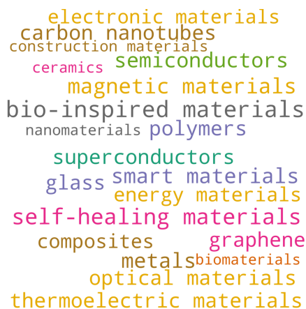
Figure 3: Wordcloud of diverse materials science topics contained in the MatSci-Instruct dataset.

contains the relevant data, and the <output> generates a pertinent response to the task.