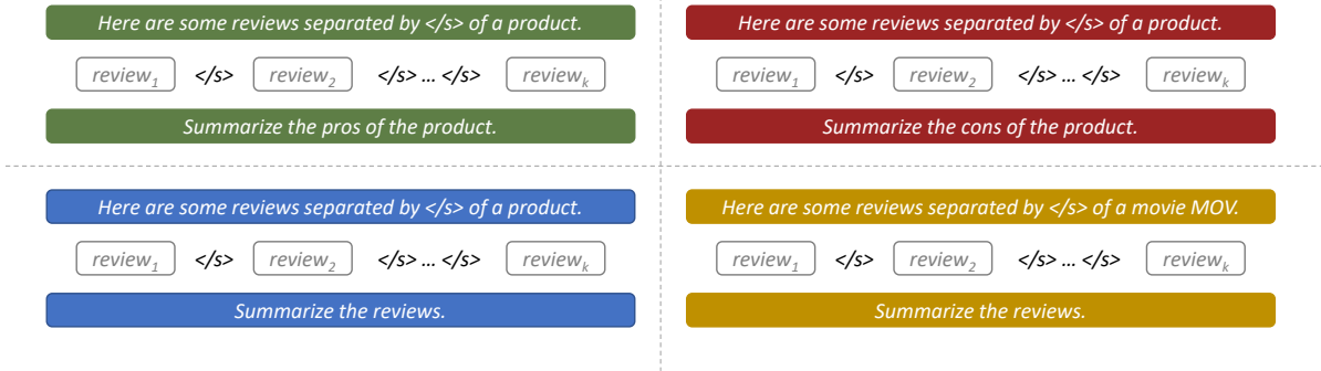
Figure 3: Prompts for LLMs in our experiments. The four prompts were used for pros , cons , and verdict in AmaSum and Rotten Tomatoes in order.

the Adam optimizer (Kingma and Ba, 2015) with 5,000 warmup steps for model optimization. The decoding strategy was beam search with a beam size of 5 and trigram blocking (Paulus et al., 2017).