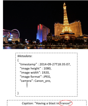
Figure 4: An entry from the MAIM dataset ( Jaiswal et al., 2017 ) showing an image/text claim with metadata.

We manually screened and filtered the papers based on abstracts and introduction sections, before creating an overview of papers across the following dimensions: (1) modality; (2) fact-checking task; (3) contribution type (i.e. dataset, modeling approach, demo); (4) paper type (i.e. survey, position paper, solution paper (e.g. introducing a new benchmark or modeling approach), or evaluation paper (e.g. investigating previously proposed approaches)). Papers were mostly excluded because they focused on other tasks than fact-checking (e.g. hate speech detection) or used modalities out of our scope (e.g. tables). Moreover, during the screening process we found and added further related works, and concluded the screening with 84 unique papers.