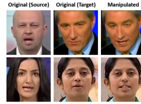
Figure 3: Example from the FaceForensic video manipulation dataset ( Rössler et al., 2018 ) showing the manipulation generation approach.