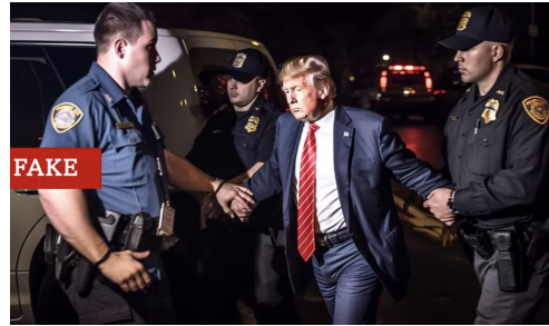
Figure 1: Manipulated image depicting arrest of former US president Donald Trump.

In AFC, the term multimodal has been used to refer to cases where the claim and/or evidence are expressed through different or multiple modalities (Hameleers et al., 2020; Alam et al., 2022; Biamby et al., 2022). Examples of multimodal misinformation include: (i) claims about digitally manipulated content (Agarwal et al., 2019; Rössler et al., 2018) such as photos depicting former US president Trump’s arrest (Figure 1); (ii) combining