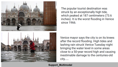
Figure 5: An entry from the Factify dataset (Suryavardan et al., 2023b) depicting an image/text claim and supporting image/text evidence document.