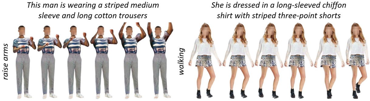
Figure 5: Qualitative examples of animatable T3H, where the motion is also controlled by the text.

The woman is wearing a striped cotton shirt, paired with long cotton pants