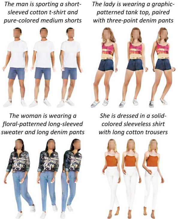
Figure 1: Text-guided 3D Human Generation (T3H).

Our world is inherently three-dimensional, where this nature highlights the importance of 3D applications in various fields, including architecture, product design, and scientific simulation. The capability of 3D content generation helps bridge the gap between physical and virtual domains, providing an engaging interaction within digital media. Furthermore, realistic 3D humans have vast practical value, especially in gaming, film, and animation. Despite enhancing the user experience, the customization of the character is crucial for creativity and scalability. Language is the most direct way of communication. If a system follows the description and establishes