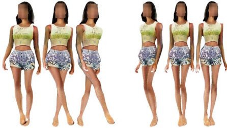
Figure 6: Qualitative examples of pose-control T3H.

She is sporting a graphic-patterned tank top with floral-patterned three-point shorts