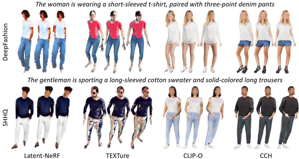
Figure 3: Qualitative comparison of pose-guided T3H.