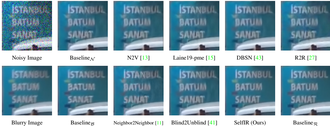
Figure 3: Visual comparison on Gaussian noise. The texts in our result are sharper and clearer. The proposed SelfIR is almost comparable to supervised Baseline \mathcal{R} , which can be seen as the upper limit of the restoration performance with the utilized U-Net architecture and the blurry-noisy pair input.