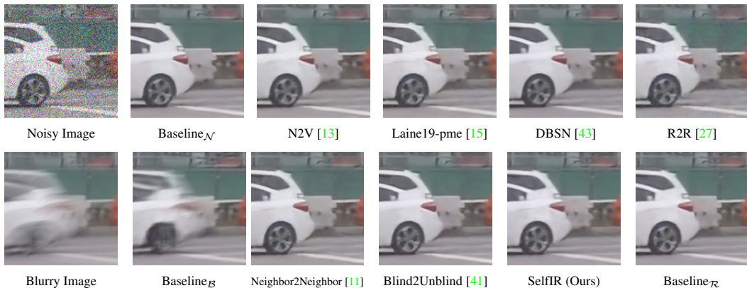
Figure 4: Visual comparison on Poisson noise. In terms of the visual result, SelfIR combines the advantages of supervised denoising Baseline \mathcal{N} and deblurring Baseline \mathcal{B} .

model (Baseline \mathcal{N} ), our method also improves the PSNR index by 0.83 dB and 1.12 dB. Due to the severely ill-posed nature of deblurring, SelfIR brings a PSNR gain by more than 6 dB comparing to the supervised deblurring baseline model (Baseline \mathcal{B} ). The results clearly show that the blurry images can indeed provide beneficial features for denoising, and so do the noisy images for deblurring.