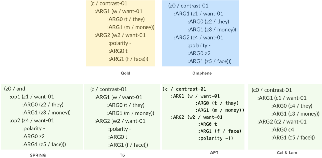
Figure 3: The gold AMR and the ensemble AMR graph of SPRING, T5, APT and Cai&Lam using the Graphene algorithm for the sentence “ They want money, not the face ”.

In this particular example, with the sentence “ They want money, not the face ”, the AMR prediction from SPRING is inaccurate. Graphene corrects the prediction thanks to the votes given from the other models. In particular, the label and of the root node z_0 of SPRING prediction was corrected to contrast – 01 because T5, APT and Cai&Lam parsers all vote for contrast – 01 . On the other hand, the labels z_1 and z_4 of the edges (z_0, z_1) and (z_0, z_4) were modified to have the correct labels z_1 and z_4 accordingly thanks to the votes from the other models. We can also see that even though the Cai&Lam method misses polarity prediction, since the other models predict polarity correctly, the ensemble prediction does not inherit this mistake. Putting everything together, the prediction from Graphene perfectly matches with the gold AMR graph in this example.