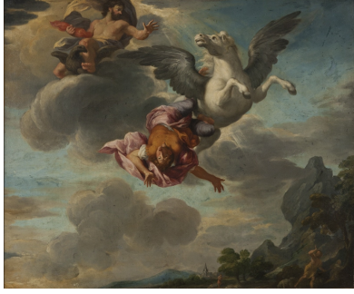
(a) "Jupiter and Bellerophon", unknown.

Baseline Llava: The image depicts a painting of a man being lifted into the air by two angels. The man is positioned in the center of the scene, with one angel on his left side and the other on his right side. The angels are holding the man, and he appears to be flying through the sky. In the background, there are two people standing, possibly observing the scene or waiting for their turn to be lifted. The painting captures a moment of wonder and awe.