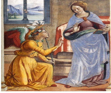
(b) "Annunciation", D. Ghirlandaio.

Fine-tuned Llava: The image features a painting of a man and a winged horse flying through the sky. The man falls from the horse, which is positioned towards the right side of the scene. The painting captures the dynamic and dramatic moment of the man and the horse soaring through the air. In the background, there is another man visible, on the left side of the painting. The scene appears to be set in a mountainous landscape, with a mountain visible in the background. The overall atmosphere of the painting is one of adventure and freedom.