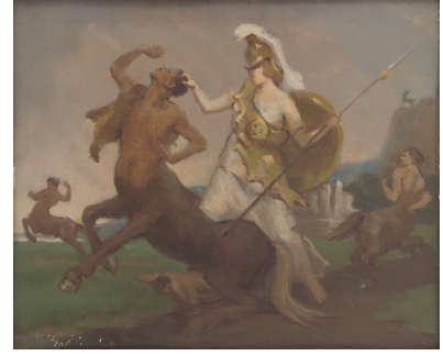
(c) "Palas Athena in Fight against Centaurs", Milan Thomka Mitrovský.

Fine-tuned Llava: The image features a painting of a woman sitting in front of an angel, who is kneeling and holding a white flower. They appear to be engaged in a conversation or a religious ceremony. The woman is wearing a yellow dress, while the man is dressed in white. In the background, there is a window with a curtain, which adds to the atmosphere of the scene. The painting is likely a religious or historical depiction, as it captures the interaction between the two individuals.