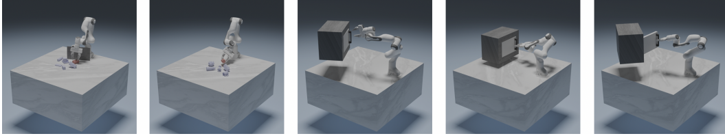
Figure 2: Training Environments We train local policies (left to right) on picking, placing, handle grasping, opening and closing.