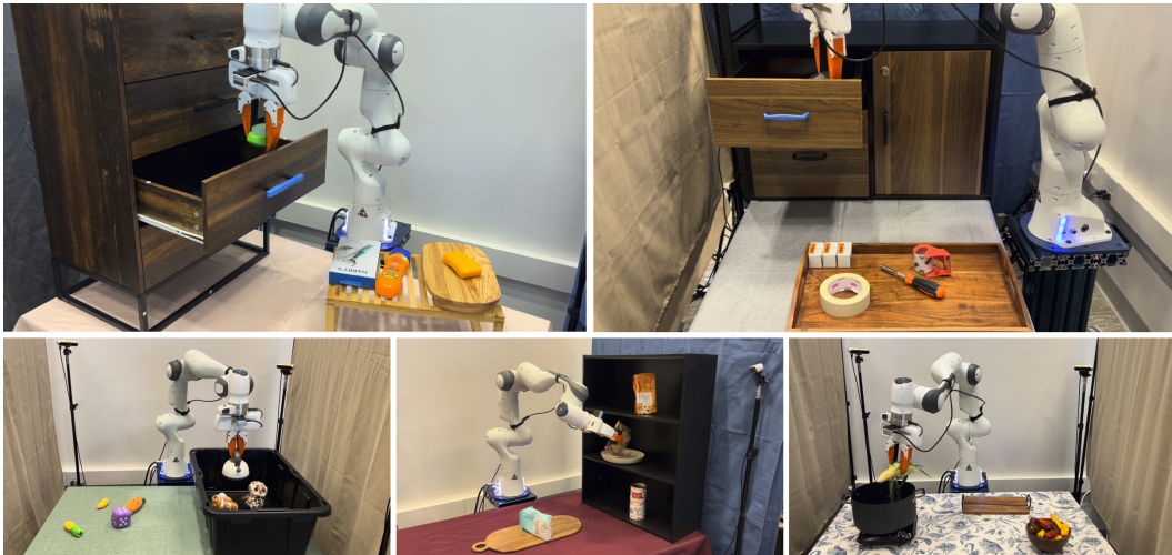
Figure 3: Zero-shot Long-horizon Manipulation Our approach trains a library of generalist manipulation skills in simulation and transfers them zero-shot to long-horizon manipulation tasks. We show a single, text-conditioned agent can manipulate unseen objects, in arbitrary poses and scene configurations, across long-horizons in the real world, solving challenging manipulation tasks with complex obstacles.