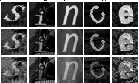
Figure 2: OCR sample data points with different interpolation factors \alpha .

For the OCR experiments, we generate data by selecting a list of 50 common 5-letter English words, such as 'close,' 'other,' and 'world.' To create each data point, we choose a word from this list and render each letter as a 28x28 pixel image by selecting a random image of the letter from the Chars74k dataset [20], randomly shifting, scaling, rotating, and interpolating with a random background image patch. A different pool of backgrounds and letter images was used for the training, validation, and test splits of the