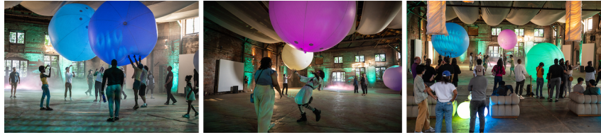
Figure 1: Participants Interacting with Sound Clouds on the Live Exhibition Day