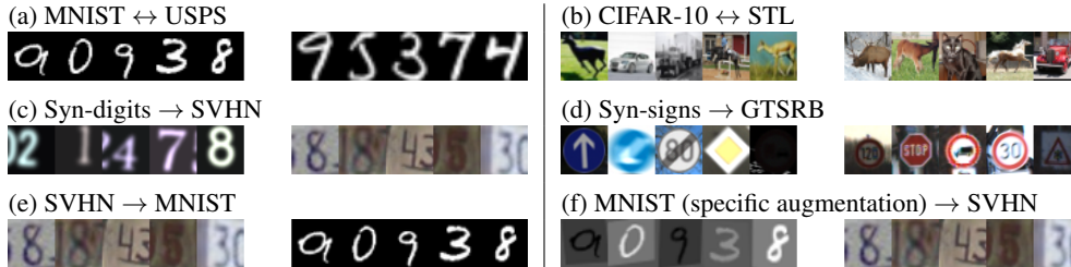
Figure 3: Small image domain adaptation example images

We addressed this problem by introducing a class balance loss term that penalises the network for making predictions that exhibit large class imbalance. For each target domain mini-batch we compute the mean of the predicted sample class probabilities over the sample dimension, resulting in the mini-batch mean per-class probability. The loss is computed as the binary cross entropy between the mean class probability vector and a uniform probability vector. We balance the strength of the class balance loss with that of the self-ensembling loss by multiplying the class balance loss by the average of the confidence threshold mask (e.g. if 75% of samples in a mini-batch pass the confidence threshold, then the class balance loss is multiplied by 0.75). 2