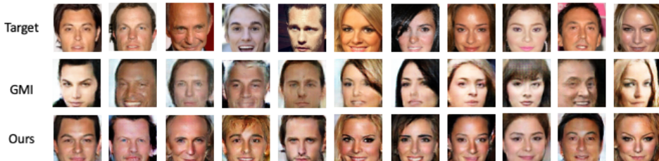
Figure 2: Qualitative comparison for attacking a face recognition model. The first row shows the ground truth image for a target identity. The second and third rows demonstrate the reconstructions produced by the GMI attack and our attack, respectively.

Cross-dataset experiment. We study the effect of distribution shift between public and private data on the attack performance. We train our GAN on Flickr-Faces-HQ Dataset (FFHQ) (Karras et al., 2019) and FaceScrub (Ng & Winkler, 2014) to attack the target network VGG16 trained on CelebA. The attack results are presented in Table 3, which shows that both GMI and our attack suffer from a performance drop while ours still outperforms GMI. We notice that the performance drop on FaceScrub is larger than that on FFHQ. One possible reason is that images in FaceScrub has much lower resolution ( 64 \times 64 ), and there are quite a few images are under poor lighting condition or only show part of the face.