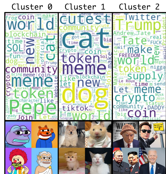
Figure 2: Word Cloud and Representative Images for Each Cluster

Cluster 1 revolves around animal themes and whimsical designs. The word cloud (Figure 2) reveals keywords like "cat," "dog," and "cutest," reflecting the lighthearted and relatable nature of the tokens. Descriptions often feature humorous and endearing animal scenarios, while visuals showcase animals like tigers, red pandas, and popular meme animals like Grumpy Cat. The use of words such