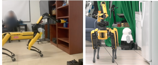
(a) go to shelf to fetch book (b) deliver juice to desk

Fig. 1: The robot is executing four task-agnostic skills sequentially to solve a novel task \mathbf{F}(\text{book} \wedge \mathbf{F}(\text{desk}_a \wedge \mathbf{F}(\text{juice} \wedge \mathbf{F}\text{desk}_a))) , i.e., fetch and deliver a book then a juice bottle to the user. Two of the four skills are shown.