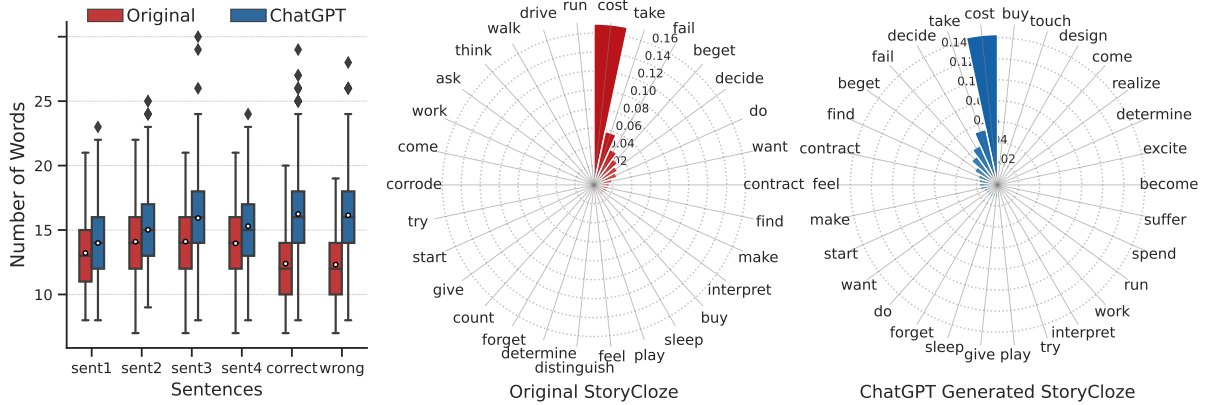
Figure 2: Comparison between the 30 most frequent events and the lengths of the sentences in the original and the ChatGPT-generated English StoryClope dataset.