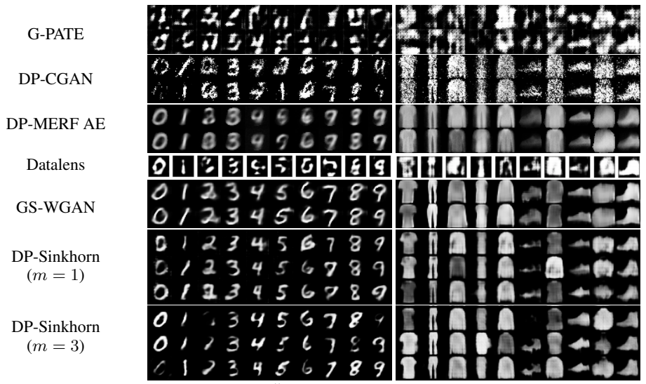
Figure 2: Images generated at (10, 10^{-5}) -DP for MNIST and Fashion-MNIST by various methods. Datalens images obtained from [14]; images of other methods obtained from [13].