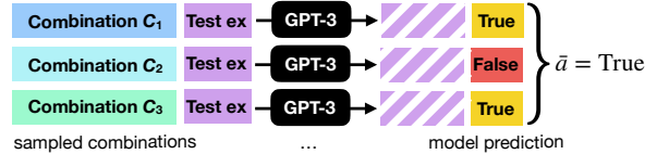
Figure 2: Silver labeling of unlabeled test example given several sampled combinations. This example is for a binary task with True or False labels (e.g., StrategyQA).

We now use the accuracy against the silver label as a surrogate objective \mathcal{O} , searching for C that maximizes accuracy with respect to the \hat{a} :