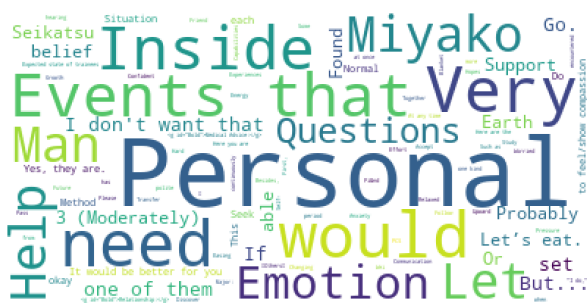
Figure 6: Word cloud map of psychological consultants’ utterances.

The English word cloud map is presented in Figure 6.