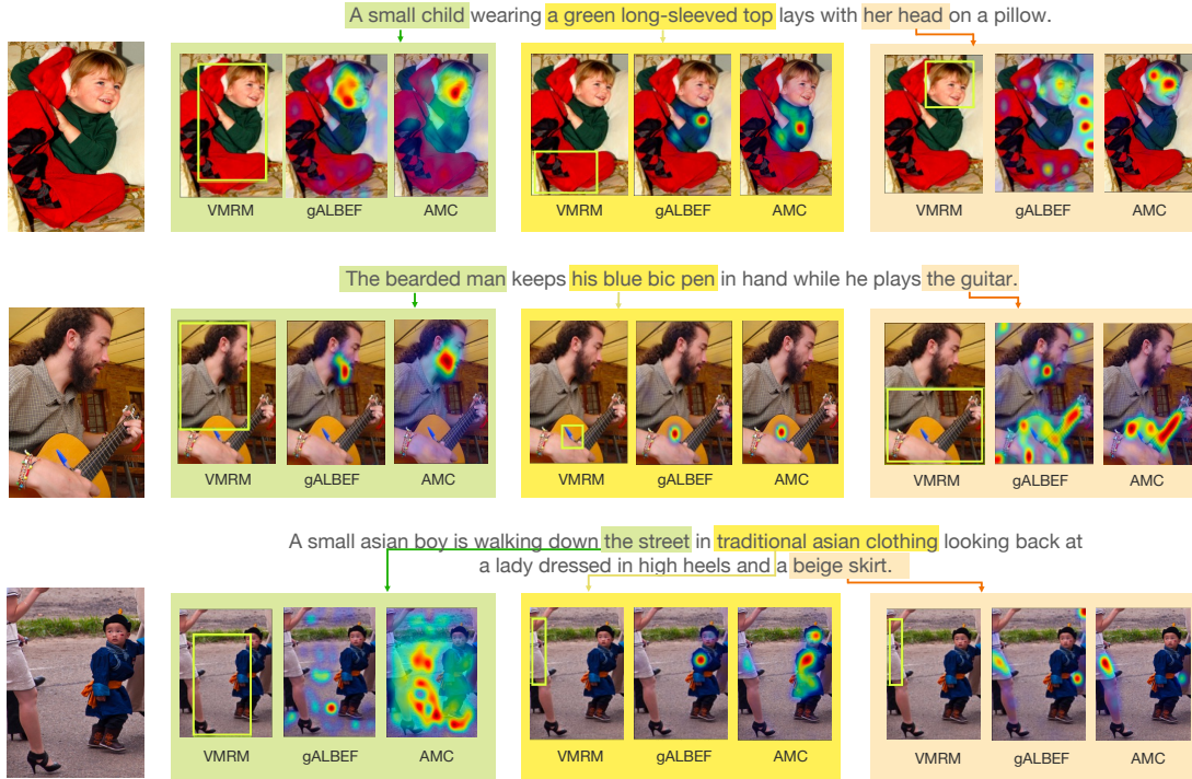
Figure 3. Qualitative comparison of the generated explanations for various images and input phrases. First column: original images from Flickr30k Entities; in each colored area from left to right: bounding boxes selected by VMRM; heatmaps generated by gALBEF; heatmaps generated by our method. On the top of each group of images, we show the caption and target phrases.