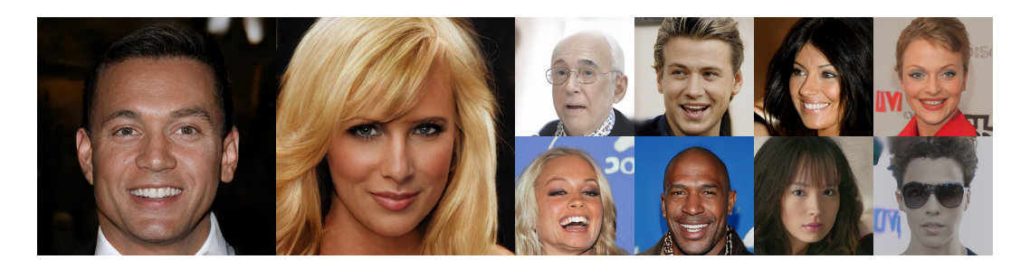
Figure 4: Synthetic face images by HiT-B trained on CelebA-HQ 1024 \times 1024 and 256 \times 256 .