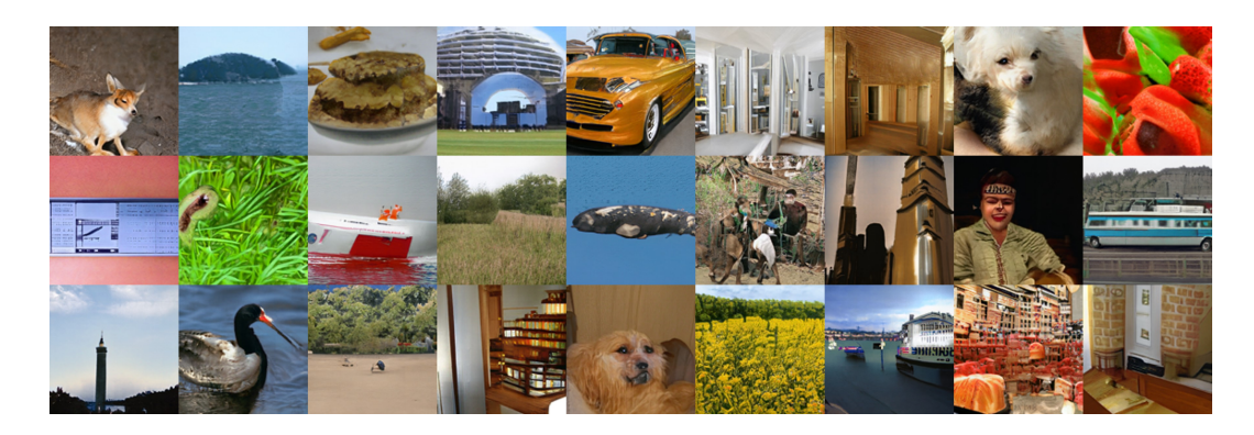
Figure 3: Unconditional image generation results of HiT trained on ImageNet 128 \times 128 .

is slightly better than BigGAN and achieves the state of the art among models with a similar capacity as shown in Table 1. We also note that [8, 36] leverage auxiliary regularization techniques and our method is complementary to them. Examples generated by HiT on ImageNet are shown in Figure 3, from which we observe nature visual details and diversity.